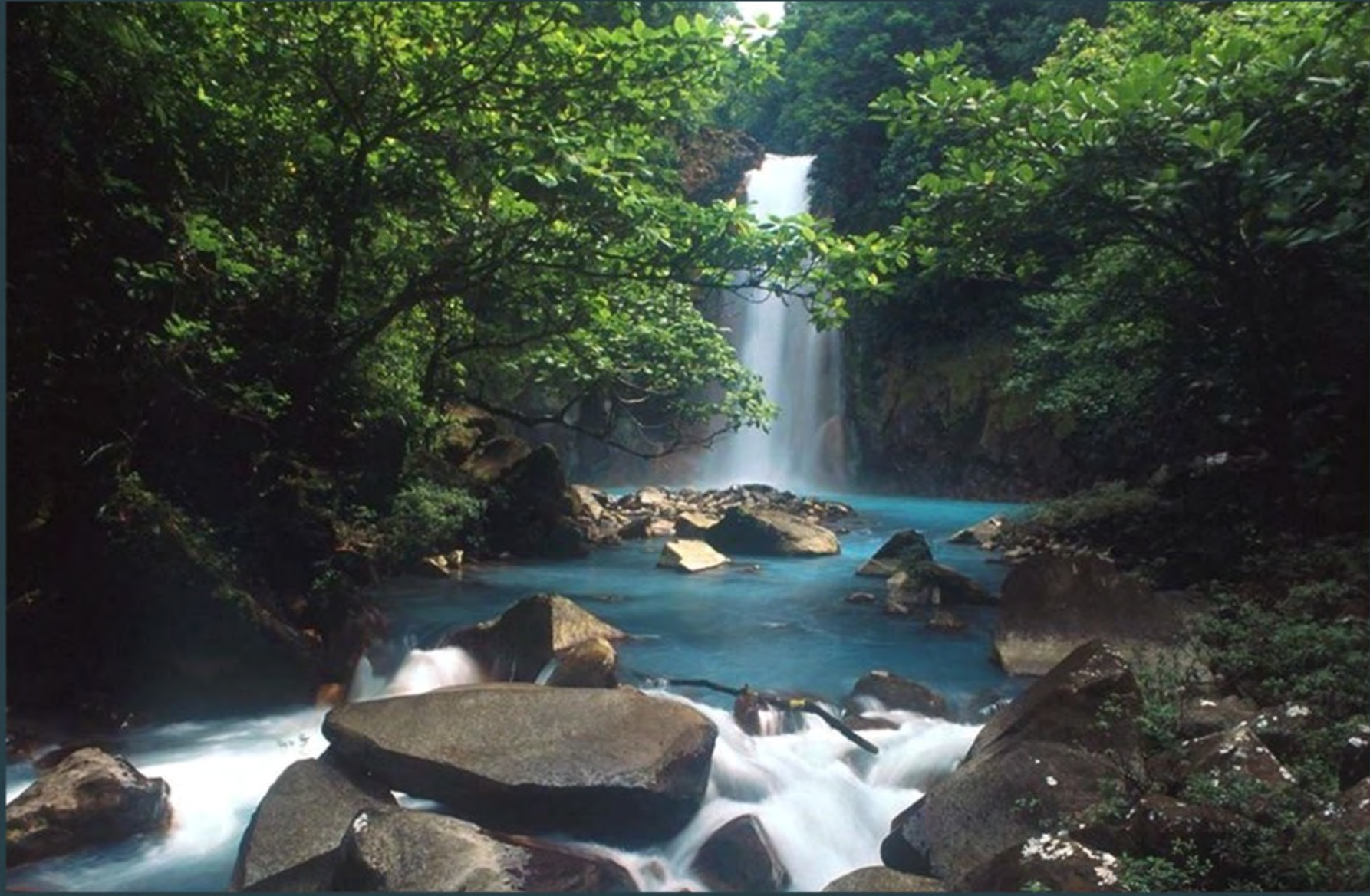
LAS GEMELAS WATERFALL